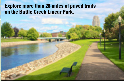
Explore more than 28 miles of paved trails on the Battle Creek Linear Park.