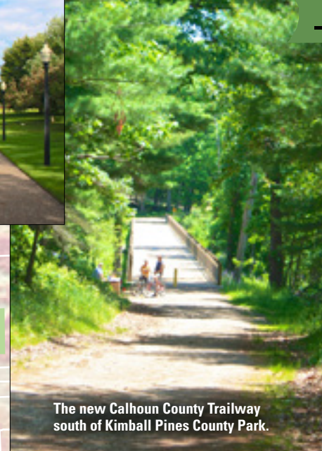
The new Calhoun County Trailway south of Kimball Pines County Park.