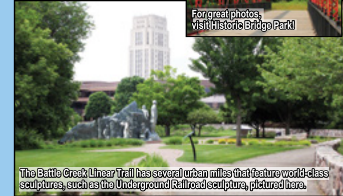
The Battle Creek Linear Trail has several urban miles that feature world-class sculptures, such as the Underground Railroad sculpture, pictured here.