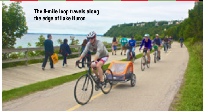
The 8-mile loop travels along the edge of Lake Huron.

many of the island's most famous historic sites and natural wonders, including Fort Mackinac, St. Anne's Church, Arch Rock, British Landing, Devil's Kitchen, the Grand Hotel, downtown Mackinac Island, and views of the Mackinac Bridge.