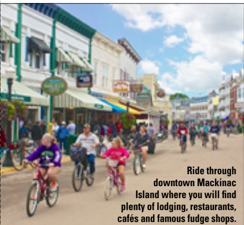
Ride through downtown Mackinac Island where you will find plenty of lodging, restaurants, cafés and famous fudge shops.