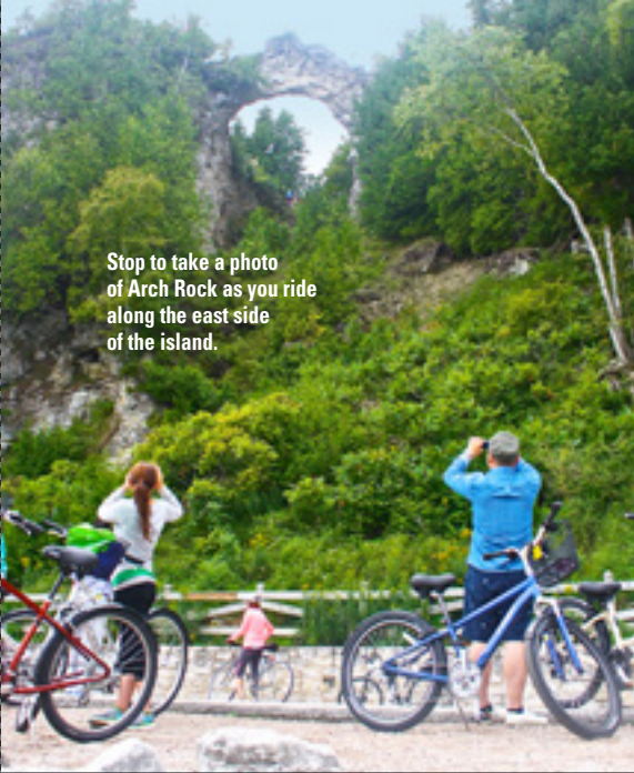
Stop to take a photo of Arch Rock as you ride along the east side of the island.